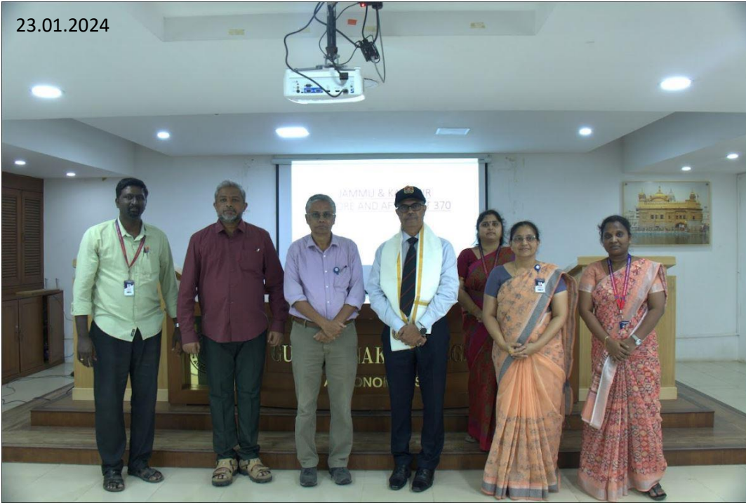
Honoring the chief Guest with Angavastharam